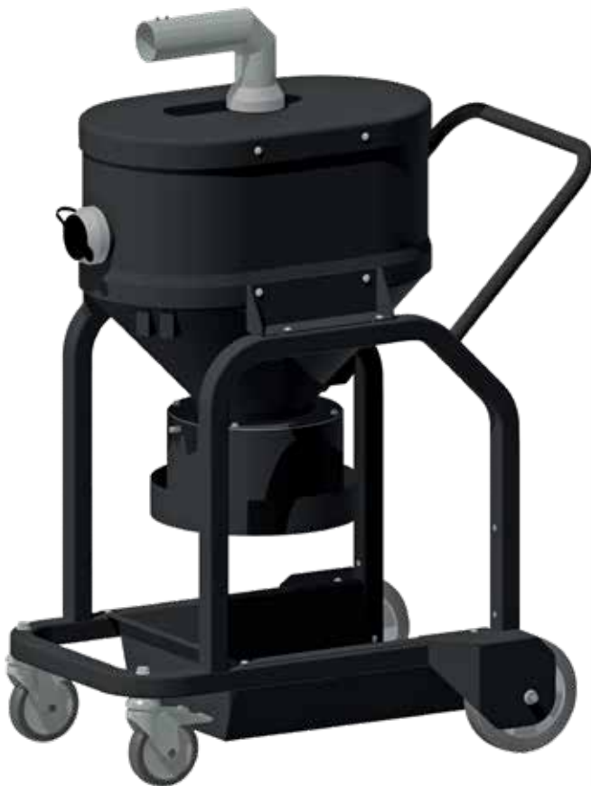
Pre-separator with drain for Longopac ®