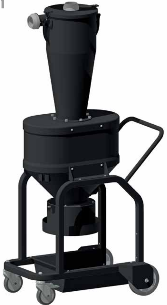
Cyclone with drain for Longopac ®